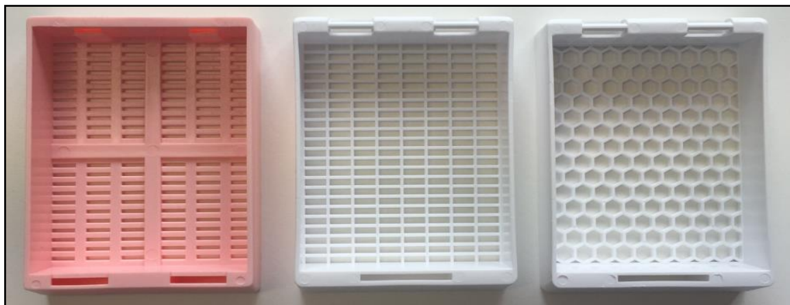
Figure 5. Large format cassette types showing (from left to right), the traditional (pink), the latest slotted (centre) and the hexagonal open pore area designs (white).