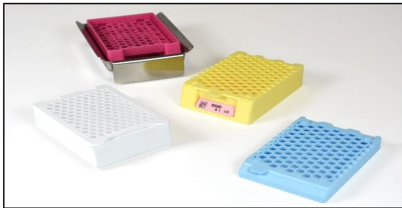
Figure 3. Large format cassettes showing the standard supra mega (SM) cassette (white), slim (blue) and mothership styles (yellow). SM mothership mold with SM mothership cassette (pink) are in the background.

tissue slices may be separated by spacers in order to reduce the well depth of the cassette. As a result, tissues remain distortion-free and benefit from consistent, high-quality processing.