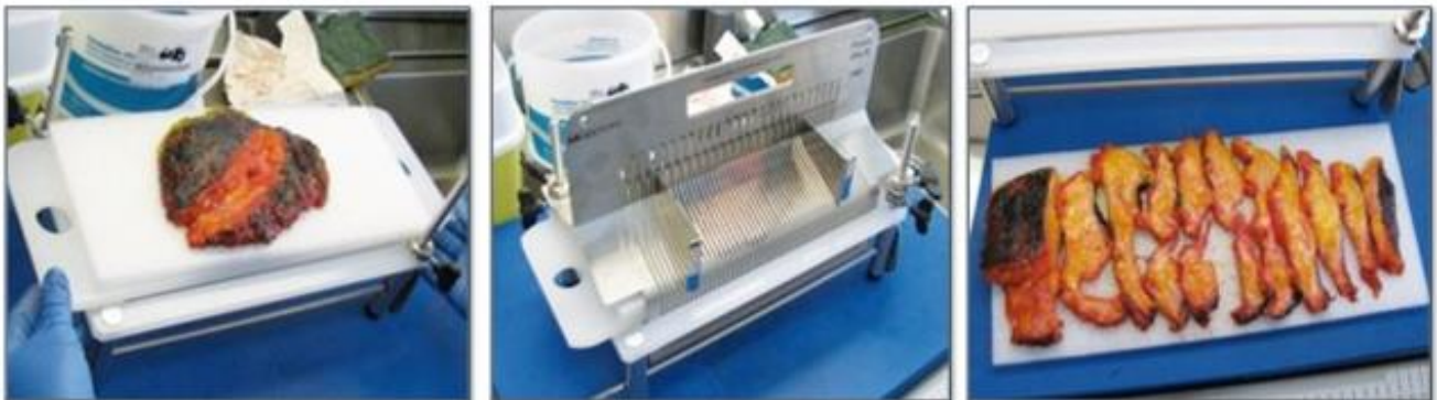
Figure 1. The ProCUT grossing system from Milestone Medical showing tissue prior to grossing (left), application of a dome (centre) and the tissue following grossing (right).

TruSlice specimen cut up systems (CellPath) are not only convenient to use but also allow reliable production of thin slices of fresh and fixed tissues in the grossing room (Figures 1 & 2).